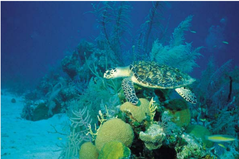
Hawksbill sea turtle

Poaching is when people take turtles and kill them and sell them for their shells.